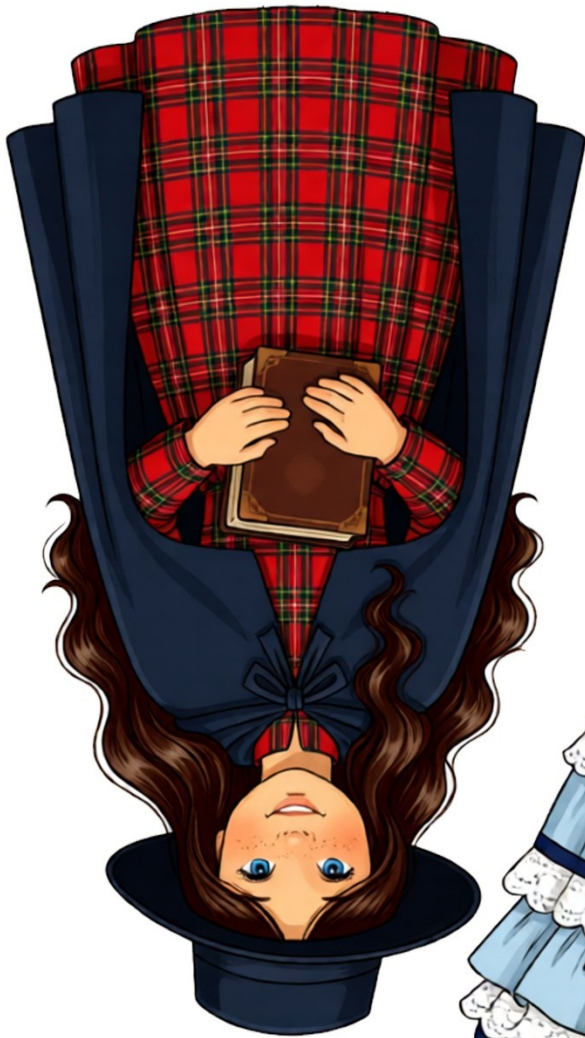
GOING TO SACRAMENTO TRAVELING CLOAK